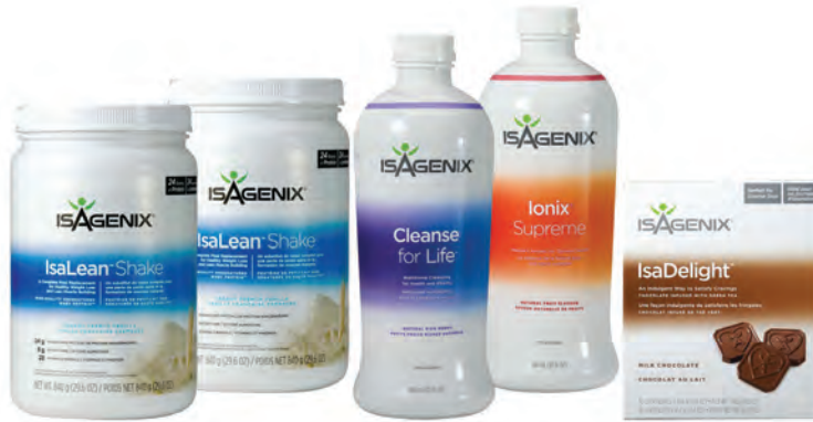
Trousse Style de vie saine